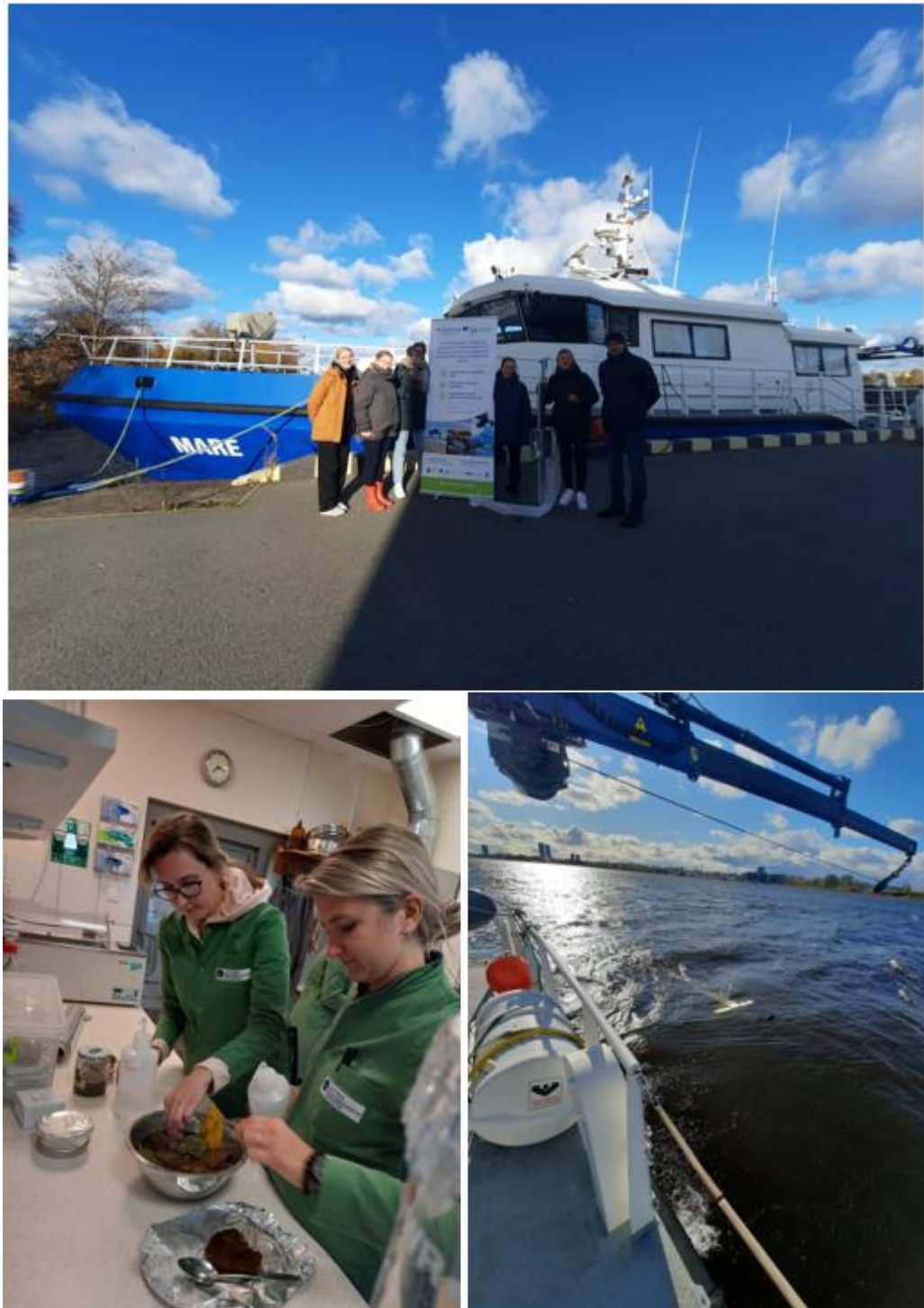
Figure 6. Snapshots from the joint field and laboratory work activities in Latvian Institute of Aquatic Ecology