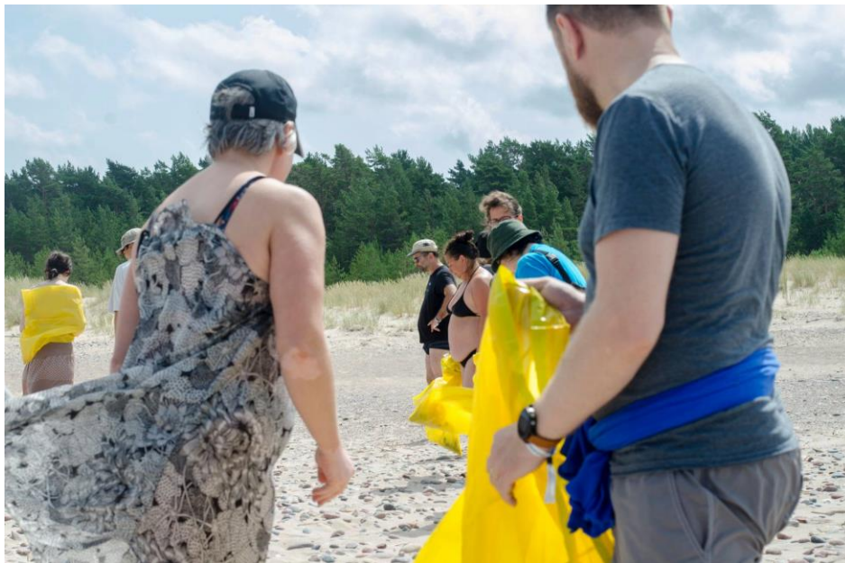
Figure 3. Beach clean up during the Latvian coast monitoring and environmental awareness raising event “My Sea campaign”.