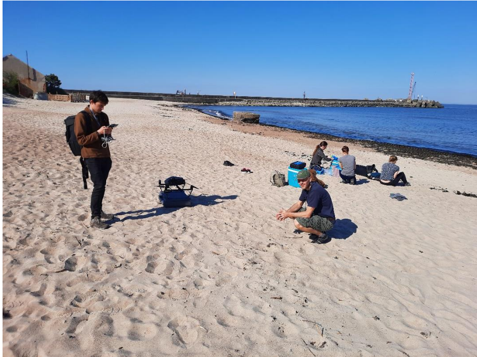
Figure 2. The pilot beach and bathing site quality monitoring campaign in Klaipeda.

During the Project's first and second year periods a high emphasis was on the field sampling and testing out the marine litter, especially plastic litter, monitoring techniques. The activities on the coastline varied from gathering the scientific data to exhibitions and environmental awareness raising events.