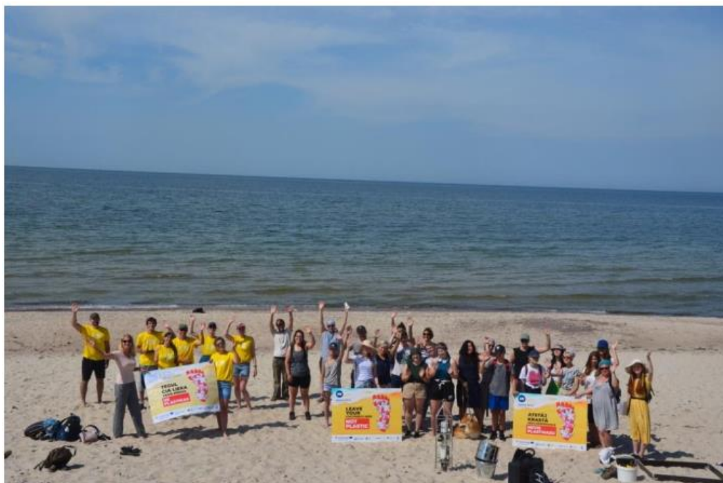
Figure 4. A group picture of the ESMIC Project Partners at the Latvian-Lithuanian boarder.

The complicated time period for the development and testing of the common monitoring techniques presented also with a unique experiences. One of such experiences, accrued, when during the July of 2021 Project consortium met at the boarder between the Latvian and Lithuanian Republics. Despite the Covid-19 restrictions this meeting not only was the first in person meeting of the Project Consortium, but also allowed all partners to work together on finalising marine litter, beach wrack/algal scum, remote sensing and microbiological analysis techniques.