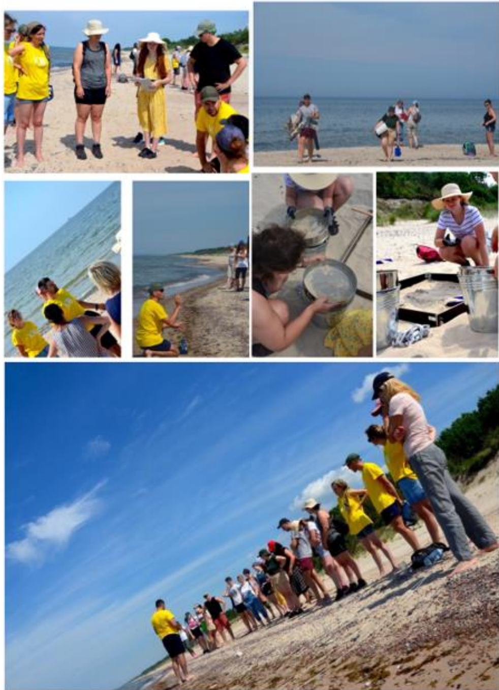
Figure 5. Snapshots from the field work activities during the Project consortium meeting at the Latvian-Lithuanian boarder